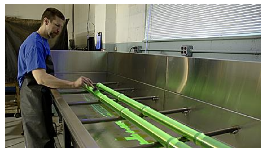
Liquid Penetrant Testing Course Curriculum